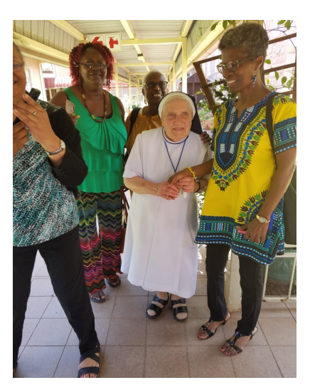
Nazareth House, Johannesburg, 2018

Note From COO : Thank you for reading our newsletter; we're committed to staying true to our Fund's mission, and we greatly appreciate any support you give. To donate a tax-deductible contribution in any amount, tap the DONATE button at the bottom of any page on our website <u>rejones.org</u> or contact us using the Contact Page on our website.