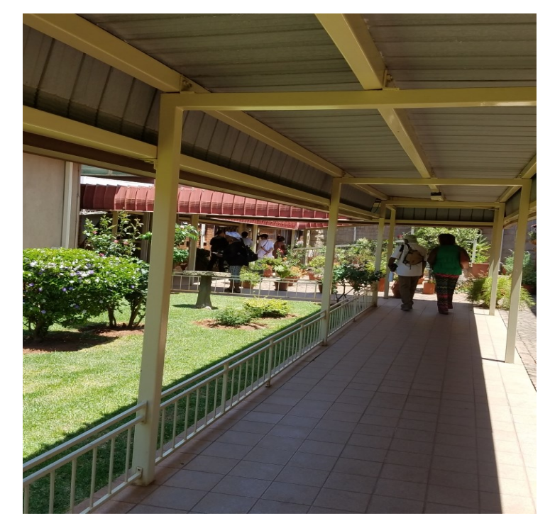
Nazareth House Orphanage, Johannesburg, South Africa 2018

At the behest of caretakers at the orphanage in Johannesburg, South Africa, the Fund sent a generous donation to help provide personal protective equipment, medication, infection control products, personal hygiene products, and nutritious foods for residents of the facility. We also donated funds toward the purchase of SpraySafe equipment for the facility.