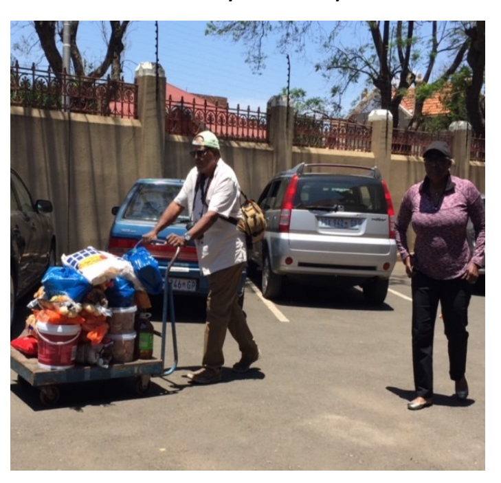
Nazareth House Orphanage, Johannesburg, South Africa