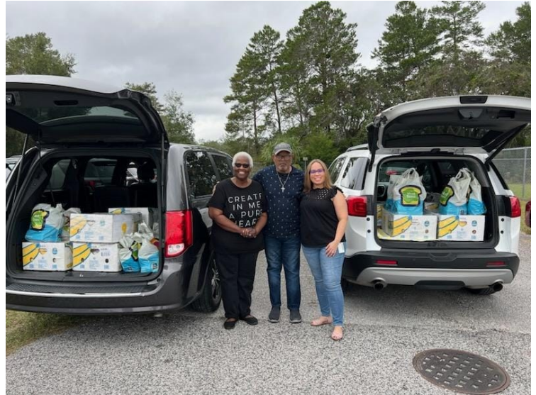
Thanksgiving (2022) Meals for Homeless Students and Families in Hernando County FL